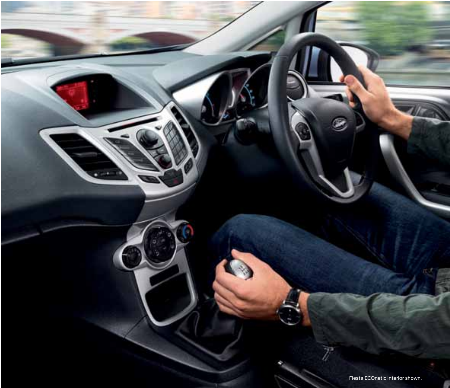
Fiesta ECONetic interior shown.

The environment is everyone's responsibility. At Ford, our 'sustainability vision' plays a key role in shaping the cars we design, engineer and build.